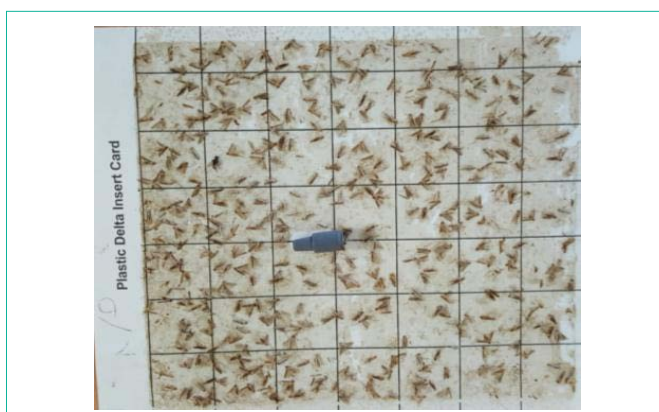
Figure 5: Mass trapping of Tuta absoluta using pheromone and sticky traps.

of tomato plants [20]. Tuta absoluta was first recorded in northern Iraq in 2009 and first recorded in Basrah during 2011; the population density of T. absoluta was determined using the pheromone traps (Figure 5), reaching the top peak of 75.24 insects per trap in Basrah. It also infested potatoes, eggplant, beans, chickpeas, and legumes; T. absoluta was effectively controlled by chemical control with Proclaim (P) and Neem [21-23]. However, wheat, barley, corn and sorghum are infested by different species of aphids, lepidoptera pest and mites in sedimentary area of the northern region [24,25]. The most common key pest is Schizaphis graminum infested wheat crop annually causes yield losses due to the transmission of the viral disease [26].