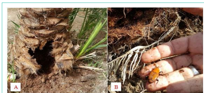
Figure 3: (A) Date palm infested by red palm weevil. (B) Adult of red palm weevil Hypochlorous ferrugineus .