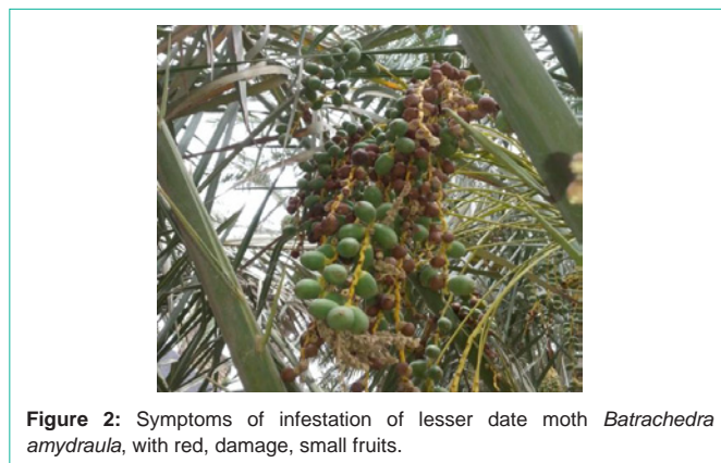
Figure 2: Symptoms of infestation of lesser date moth Batrachedra amydraula , with red, damage, small fruits.

regions, are attacked by numerous insects which cause economic and cosmetic damages for the valuable plant parts such as the leaf and fruits. To manage and minimize their impacts, many researches have been carried out on the control of vegetable pests including aphids, Lepidoptera pests, beetles, mites, like Tetranych usurticae and many other pests on radish, celery, leek, onion, beans, Okra, cabbage, Lettuce, and others [11-19].