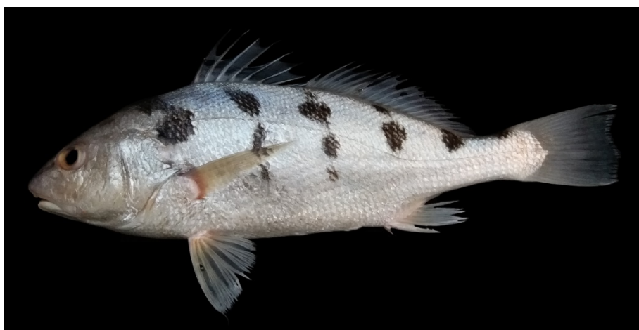
Fig. 3: N. maculate from the Iraqi marine waters.