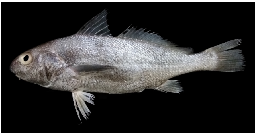
Fig. 2: J. amblycephalus from the Iraqi marine waters.

The bearded croaker (Fig. 2) is characterized by a moderately deep body (28.07 – 28.87 % in Standard length). Snout is steep, bluntly rounded, projecting in front of upper jaw, mouth inferior, a stiff and blunt barbel on chin. Total length ranged from 216 to 230 mm. Head length ranged from 30.23 to 32.29 % in Standard length and head depth 19.98 – 25.32 %. The second and third spines fairly elongate (20.09 – 22.66%). Dorsal fin with 10 spines followed by a notch, second part of fin with one spine and 24 rays. The anal fin has two spines followed by seven rays. Caudal fin slightly rhomboidal. Gill rakers ranged from three to four on upper limb and eight on lower limb of first gill arch (Table 1).