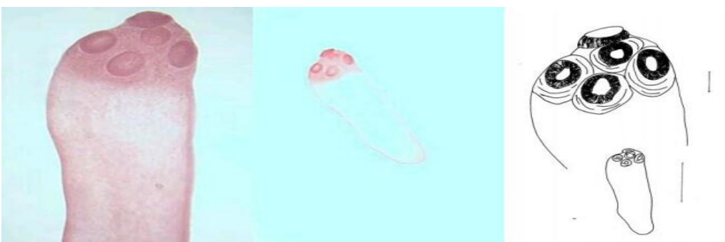
Figure 2 Stoibocephalum sp2 scale bar of head 0.05 and total length 0.5 mm