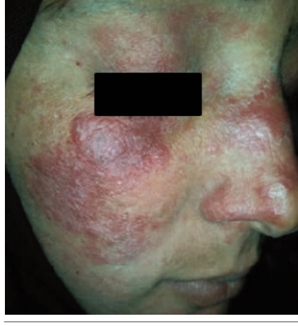
Figure 3. Tinea incognito on the face resembling lupus erythematosus.