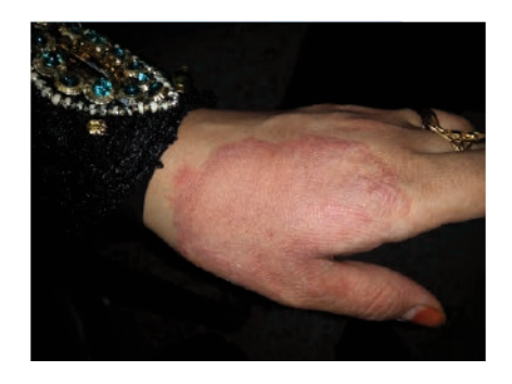
Figure 1. Tinea incognito involving the hands and nails masqueraded as acute or chronic eczema.