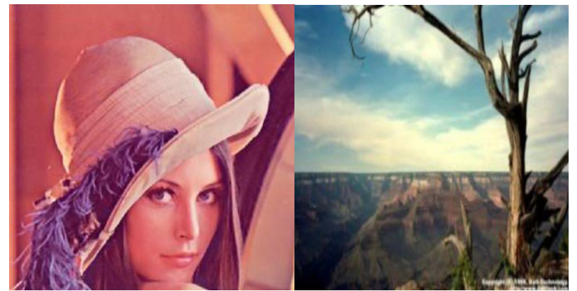
Figure 2. Lena image vs. tree image

The two-color images with 256x256, 250x360 pixels is used for testing process, the images are Lena and Tree as in figure 2: