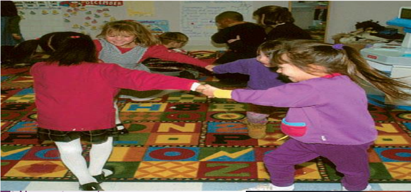
Figure 1-1 Good nutrition shows in the happy faces of these children

Figure 1-2 The poor-quality hair, mottled complexion, dull expression, spindly arms and legs, and bloated abdomen of this baby girl exemplify many signs of malnutrition.