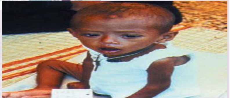
Figure 1-2 The poor-quality hair, mottled complexion, dull expression, spindly arms and legs, and bloated abdomen of this baby girl exemplify many signs of malnutrition.