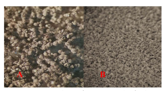
Fig. 3. Microscopic shape of some example of Cultures of some isolated fungi, a: Aspergillus niger , b: Penicillium sp. (16X)

Since fungi can tolerate higher concentration of heavy metals and other pollutant, they play important role as bioindicators for different pollutant in the water ecosystem<sup>43</sup>. In the present study, nine fungal species were isolated from the surface sediments (Table 7, Fig. 3). Most