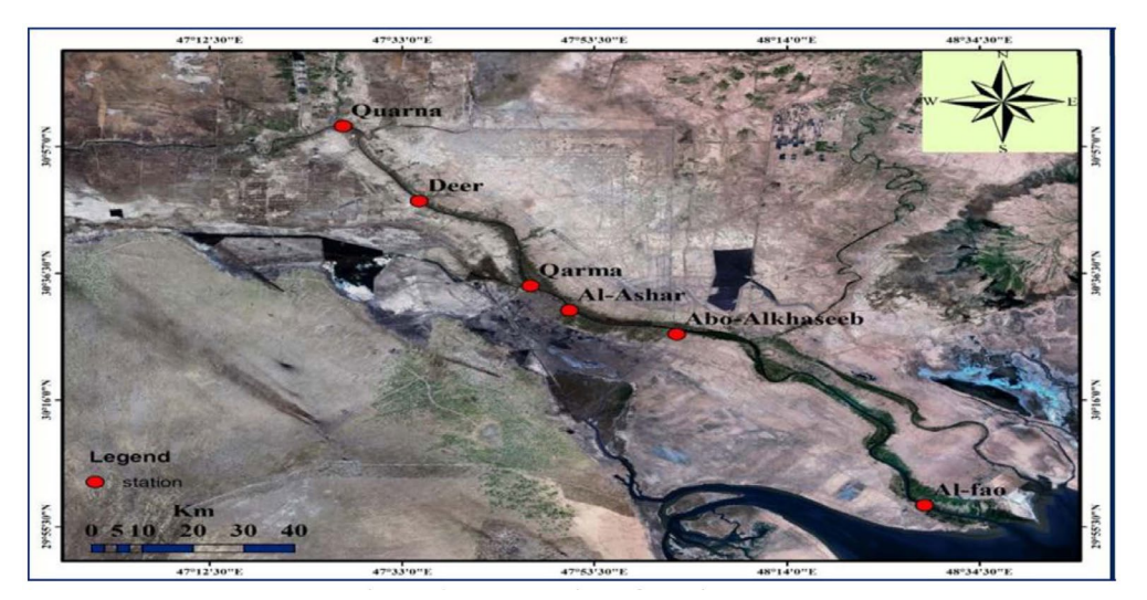
Fig. 1. The location of studied area